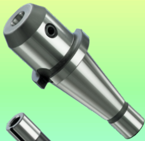
SLH : ISO