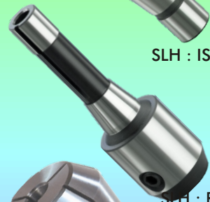
SLH : R8