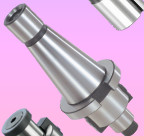
SMA : ISO